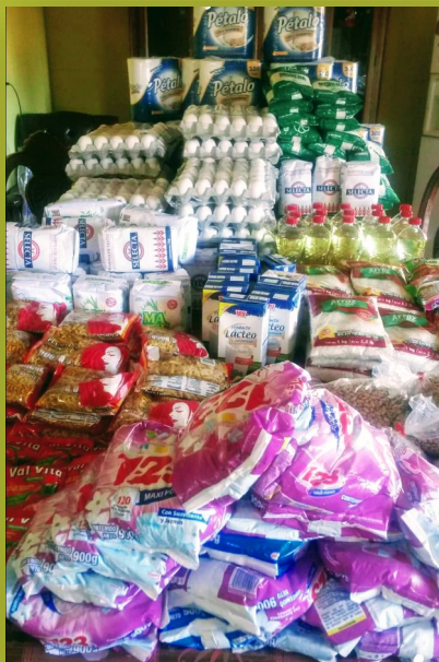
Below: Food staples ready for dispensing to the community of Durango, a weekly program designed to help during the pandemic.