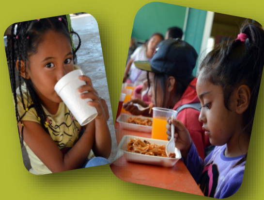
Above: Recent scenes from our partner feeding programs.